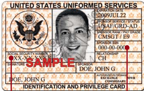
DD Form 1173

Dependent SSN will be replaced with XXX-XX-XXXX