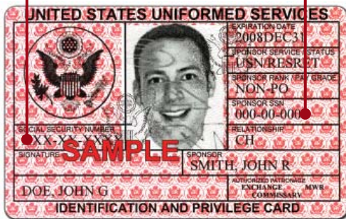
DD Form 1173-1