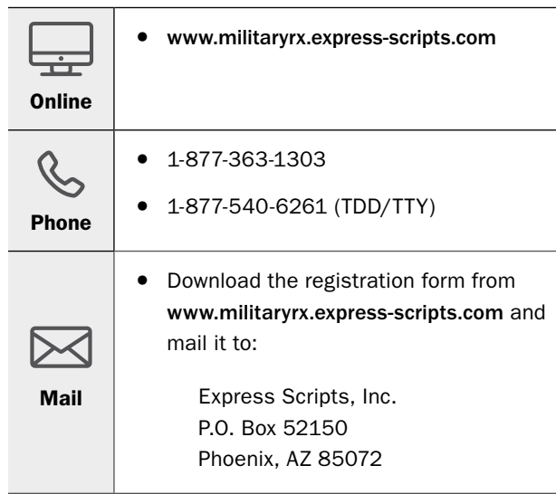
Figure 2.1 TRICARE Pharmacy Home Delivery Registration Methods

To get up to a 90-day supply of your current maintenance medication prescriptions sent to your home, you can call Express Scripts. You may also contact Express Scripts to convert your current military pharmacy prescriptions to home delivery. Home delivery copayments apply.