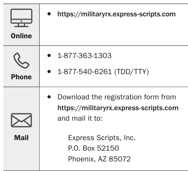
Figure 2.1 TRICARE Pharmacy Home Delivery Registration Methods

Call Express Scripts to lower your out-of-pocket costs by transferring your current maintenance medication prescriptions to TRICARE Pharmacy Home Delivery. You may also contact Express Scripts to convert your current military pharmacy prescriptions to home delivery. Home delivery copayments apply.