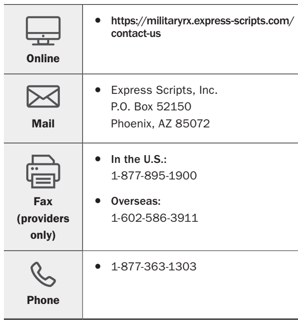
Figure 4.1 Express Scripts Contact Information

Certain specialty medications may only be available through home delivery or retail pharmacies in the specialty network. The specialty network is a select network of retail specialty pharmacies in the TRICARE retail pharmacy network. These pharmacies have expertise in medication management for conditions that require specialty medications, and are able to provide these specialty medications to beneficiaries. Visit https://militaryrx.express-scripts.com/find-pharmacy to find a pharmacy in the specialty network.