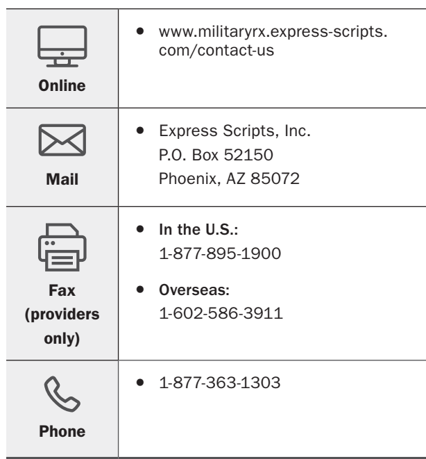
Figure 4.1 Express Scripts Contact Information

You may also be able to fill your prescription through your military pharmacy, or in some cases, certain TRICARE retail network pharmacies when the medication isn't available through TRICARE Pharmacy Home Delivery.