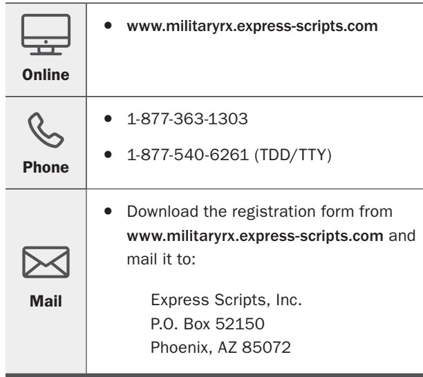
Figure 2.1 TRICARE Pharmacy Home Delivery Registration Methods

To get up to a 90-day supply of your current maintenance medication prescriptions sent to your home, you can call Express Scripts. You may also contact Express Scripts to convert your current military pharmacy prescriptions to home delivery. Home delivery copayments apply.